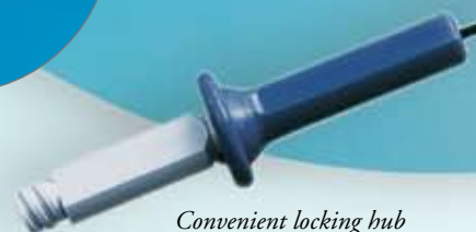
Convenient locking hub for procedural efficiency