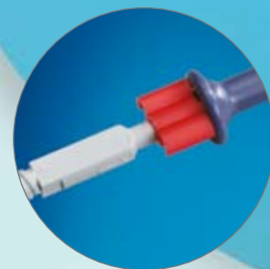
Packaged with new Red Spacer Clip which is designed to keep the needle inside the catheter until used